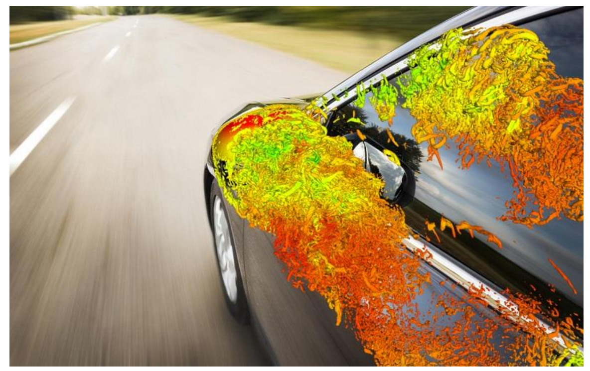
<u>Image:</u> Fluctuating surface pressures on the side glass of the car calculated using <u>OpenFOAM®</u> open source <u>CFD code</u>. Complex, fluctuating surface pressure data can be imported into VA One from nearly any commercial CFD code.