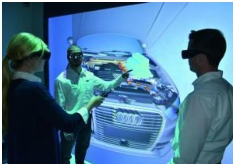
Image: Thanks to Virtual Reality, Audi can virtually simulate assembly processes in immersive 3D and optimize them step by step. Read the related article in Audi's Engineering Blog (in German).

If Virtual Reality has been a popular technology in the business of video games for several decades, its use for industrial applications only dates back to the late 2000s. Giving engineers the ability to immerse themselves in a virtual 3D environment, Virtual Reality is now used by leading industrial manufacturers to experience their future products and interact with them naturally and intuitively. By enabling engineers to experience a product early in its development, Virtual Reality helps manufacturing companies ensure design feasibility and avoid costly design errors. Maintenance operations and use cases can be evaluated before any real prototype even exists. Furthermore, Virtual Reality facilitates collective decision-making by allowing specialists and non-specialists to collaborate around the same model, whether they are on-site or remote.